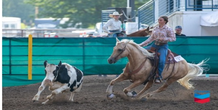
Look close at the picture ...She only has one rein!